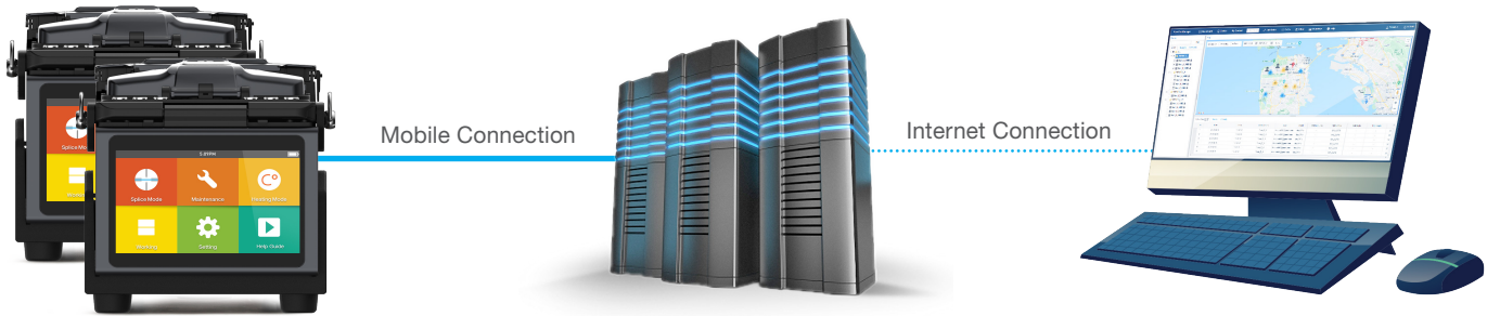
INNO's Pro Series Splicers

View Pro Management System is an integrated cloud-based software platform for INNO's splicers. This innovative web-based application allows both technicians and managers of the splicers to maximize the use of its assets and to achieve the highest work efficiency. Real-time communications with tiered access rights and options to manage job orders, manage splicing machines, and send/receive reports are only a small part of the innovative work processes offered by the View Pro.